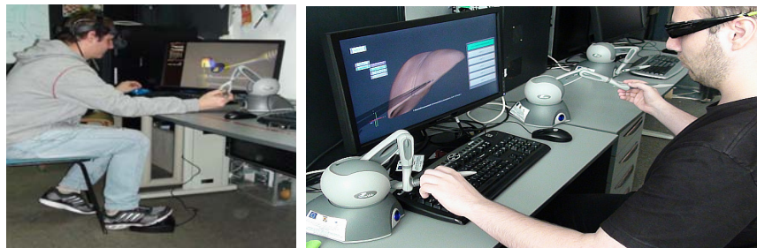
Figure 2. Working sessions with Virdent (left) and HapticMed (right)

The CeRVA team [42] (Research in virtual and augmented reality) from the Faculty of Mathematics and Computer Science, Ovidius University Constanta started to experience the use of haptic devices in 2008, in the framework of Virdent project (PNII 12083/2008). The Virdent project (Figure 2) was oriented towards the preparation simulation in fixed dental prosthesis. It offered a non-invasive, feasible, simulation providing the necessary feedback for learning and offering students the capacity to recover from erroneous situations. The simulator included recording and real-time evolution of the student evaluation by the teacher [15].